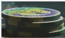
Tahoe Days, Reno Nights