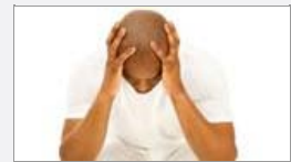
Signs And Symptoms Of Bipolar Disorder