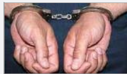
Bay Area Crime Reports